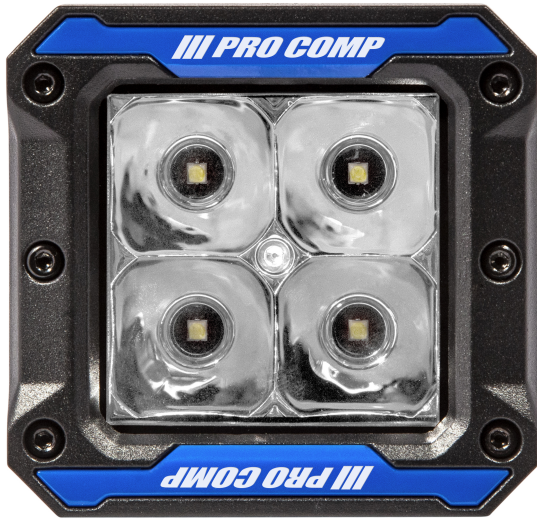
LED Sport Light