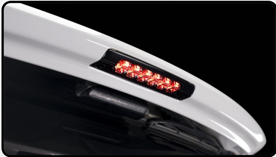
1 X 3 RD BRAKE LIGHT ASSEMBLY