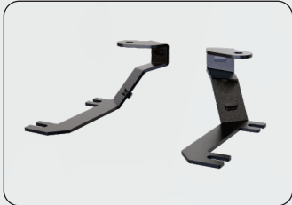
2X DITCH LIGHT BRACKETS