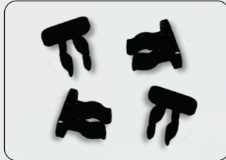
4X WIRE CLIPS